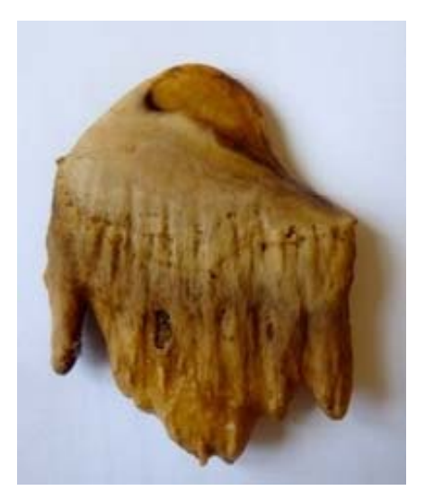
Fig. 3. Tooth of Gervais' beaked whale Mesoplodon europaeus, Calheta de Baixo, Maio, Cape Verde Islands, 15 May 2013.

Local inhabitants at the stranding site were asked whether the animal, when first encountered, was still alive, but answers were ambiguous and it was not possible to get an unequivocal opinion. However, the very fact that it was butchered suggests that the whale must have been very fresh, if not indeed alive. Due to the mutilated state of the carcass, it was not possible to assess the possible cause of the stranding through postmortem dissection.