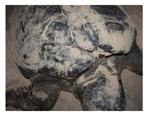
Fig. 1. The injured turtle during the first encounter on 12 July 2013.

the time, the turtle was allowed to return to the sea in the hope of finding it again during the next beaching episode, with everything prepared on site to attempt surgical carapace cleaning and stabilization.