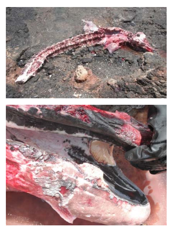
Fig. 1-2. Gervais' beaked whale Mesoplodon europaeus , Calheta de Baixo, Maio, Cape Verde Islands, 15 May 2013.

curated at the premises of the Fundação Maio Biodiversidade (Porto Inglês, Maio) and will be available for future study.