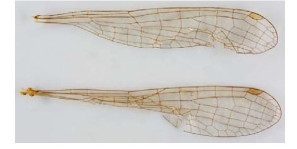
Fig. 2. Agriocnemis exilis, wings of specimen ZFMK ODO 2008/5.