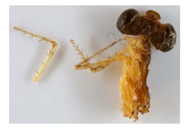
Fig. 1. Agriocnemis exilis , head, thorax and legs (partim) of ZFMK ODO 2008/5.

BOA VISTA: (4b) 1 adult male [ZFMK cat. no. ODO 2008/5], H. Lindberg coll., K.F. Buchholz det. First record for the Cape Verde archipelago (Fig. 1-3).