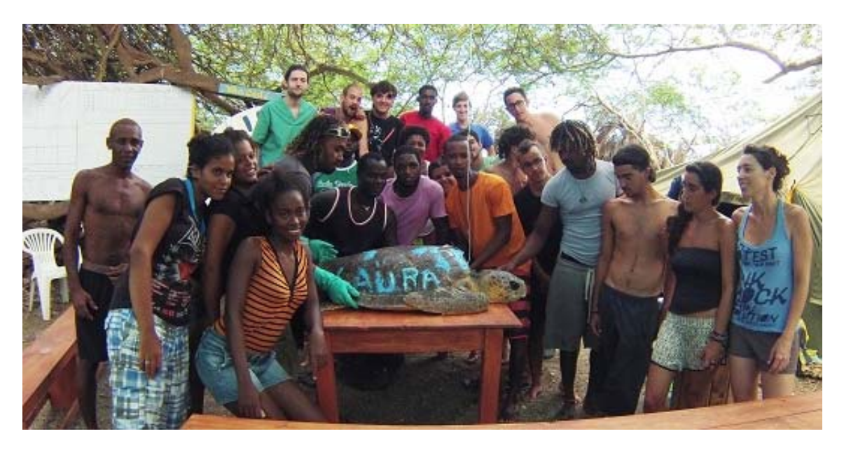
Fig. 8. Part of the staff involved in the turtle's rehabilitation at the João Barroso field camp.

Apart from these public awareness aspects, valuable clinical information was obtained from surgery and anaesthesia, to the benefit of future field technical work. Finally, but not less important, taking the opportunity for experience exchange with technical personnel, perform practical in situ work and share experiences and materials, significantly promoted knowledge diffusion and improved surgical skills and interest among local staff.