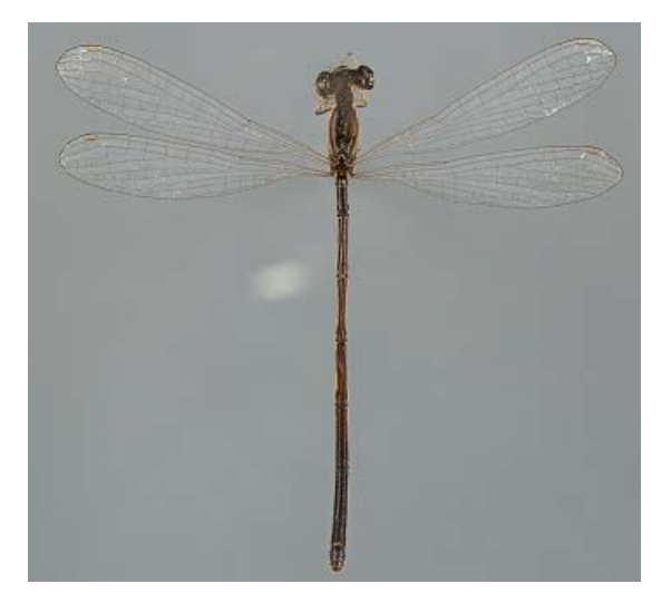
Fig. 4. Agriocnemis exilis, female, collected aboard ship, ca. 100 nm off West Africa in November 1893.

Movements of the desert locust Schistocerca gregaria (Forskål, 1775), which occasionally plagues Cape Verde, are monitored by the Food and Agriculture Organization of the United Nations (cf. FAO 2014). Locust movements from continental West Africa (Mauritania, Western Sahara, Senegal) to the Cape Verde Islands, as well as between islands within the archipelago, are facilitated by favorable winds that could also carry accidental odonate visitors. Possibly, the movements of S. gregaria can be used to better understand the origin and pathway of odonates that have only occasionally been reported from Cape Verde.