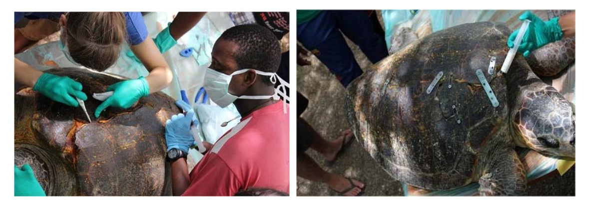
Fig. 4. Fracture cleaning and debridement. Fig. 5. Orthopedical fixation of the carapace fracture (Rosa García Cerdá).

6). Once the turtle was fully recovered from two hours anaesthesia, it was released on the beach (Fig. 7). The animal responded quickly by approaching the water and entered the sea as normally observed in females after egg laying.