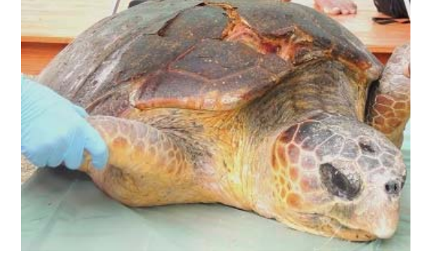
Fig. 2. The injured turtle immediately before surgery (Vanesa Martínez).

Beach surveillance was increased during the most likely nesting days to maximize the possibility of detecting the female. Loggerheads of the Boa Vista population usually nest 4-6 times every 14-18 days. Eventually, the animal was found back on the same beach on 3 September 2013, 53 days after the first encounter (Fig. 2).