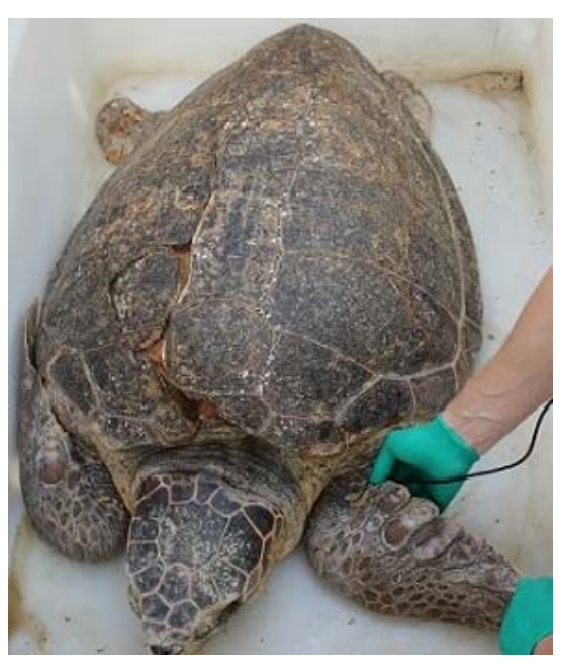
Fig. 3. Monitoring the turtle's vital functions (Vanesa Martínez).

Metacam® 5 mg/ml, Boehringer Ingelheim Vetmedica GmbH, Ingelheim am Rhein, Germany) was used for pain relief and antiinflammatory effect. Antibiotic coverage was achieved with intramuscular enrofloxacin (5 mg/kg; Baytril® 5%, Bayer Hispania SL Barcelona, Spain) prior to surgery and subcutaneous long acting ceftiofur (15mg/kg; Naxcel® 100 mg/ml, Pfizer Limited Puurs, Brussels, Belgium) postsurgery. During surgery, muscular tone and reflexes and cardiovascular performance monitoring by Doppler flow unit (Minidop ES-100VX, Hadeco, Japan) were used for anaesthesia plane follow up (McArthur et al. 2004) (Fig. 3). An intravenous catheter (Venofix® A, 21 G, Braun, Melsungen, Germany) was placed into the cervical dorsal allow adequate fluid sinus to therapy administration (1000ml saline FisioVet®, Braun