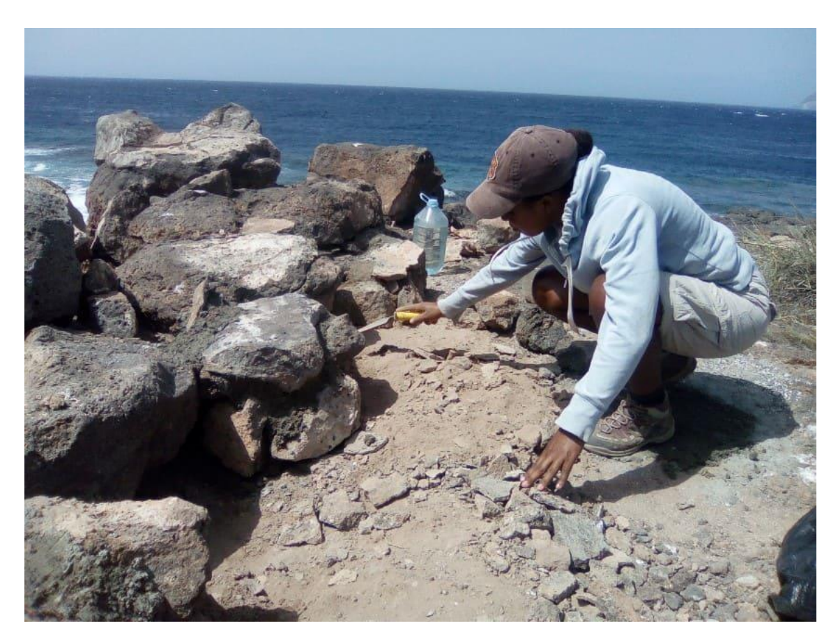
Fig. 2. Construction of artificial nests for Cabo Verde shearwaters Calonectris edwardsii in the southwest of Raso Islet, Cabo Verde.

Additionally, ten chicks were randomly selected from a southwest population on Raso Islet to serve as controls. Both translocated and control chicks were monitored three times per week in the mornings. During this monitoring, biometric data was collected – length of wings, and weight. The wing measurement was taken using a ruler ( \pm 0.5 mm) and weight using a spring scale ( \pm 10 g). The chicks were always measured and weighed by the same person. These data were collected until the chicks were able to fly (mid of November). The information gathered was compiled into a database made