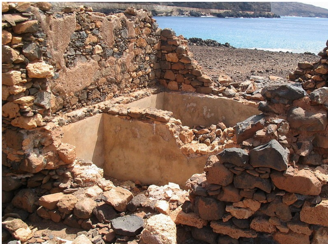
Fig. 1. Ruins of the whaling station at Barreiras, São Nicolau, 23 September 2006.

It has proved difficult to obtain reliable figures on the production of most of the Cape Verde whaling stations. Statistical information on exports of small quantities of whale oil and blubber from the Cape Verde Islands is often