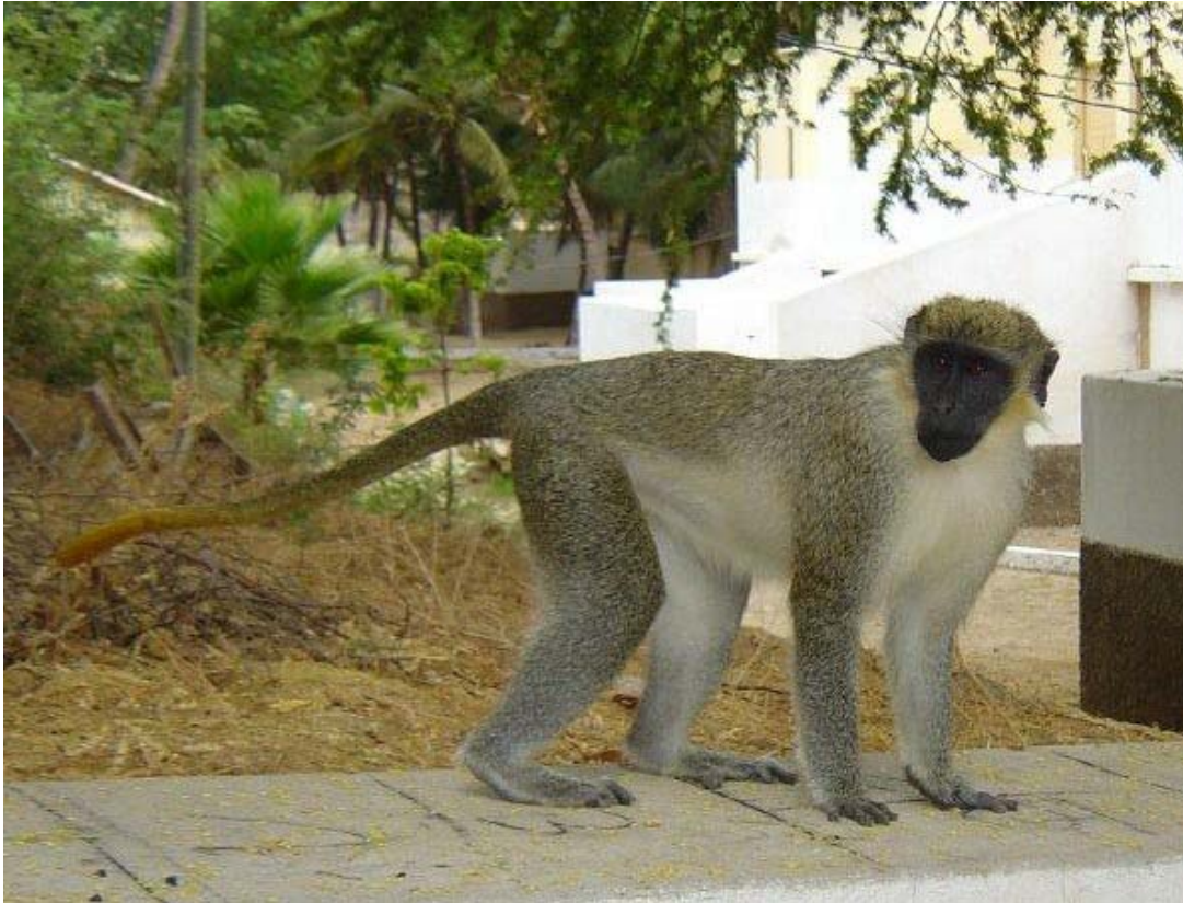
Fig. 4. Green monkey Chlorocebus sabaesus , Tarrafal, Santiago, July 2005 (Juan Roch).