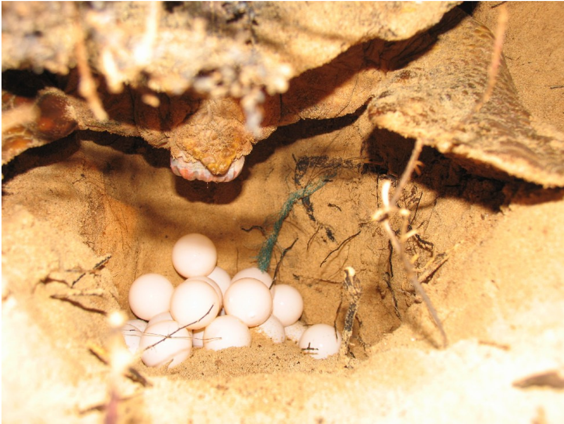
Fig. 2. Egg laying by a loggerhead turtle Caretta caretta in a vegetated dune in southeastern Boavista, 29 August 2006.