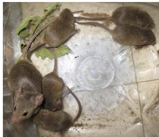
Fig. 6. House mouse Mus musculus , adult and young, Porto Novo, Santo Antão, 28 April 2008 (Simon Baliteau).

Rats Rattus sp. have been reported from several islands, but it has not always been clear whether this concerned the black rat R. rattus (L., 1758) or the brown rat R. norvegicus (Berkenhout, 1769). On Santiago, the presence of brown rats was confirmed in the capital Praia during the 1990s (CJH pers. obs.) and in the Serra Malagueta during the years 2006-2007 (Cesarini et al. 2008). It is likely that brown rats also occur elsewhere on the island. During the years 1988-2010, brown rats were occasionally seen in the harbour region of Mindelo on São Vicente (CJH pers. obs.). The presence of black rats has been confirmed on Santiago, i.e. at Trindade (Heim de Balsac 1965, de Naurois 1969, 1982), São Domingos (Rabaça & Mendes 1997) and in the Serra Malagueta (Cesarini et al. 2008). Unidentified rats Rattus sp. have been reported from Brava, Santo Antão, São Nicolau, Boavista and Maio by our correspondents (see Acknowledgements) and from Fogo by Siverio et al. (2008).