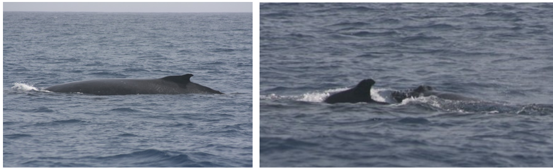
Fig. 1-2. Humpback whale Megaptera novaeangliae , cow and calf pair, off Santa Maria, Sal, Cape Verde Islands, 15 August 2010.

westward direction at 16°34,6'N, 22°52,4'W (depth 30-35 m), off Santa Maria along the southern coast of Sal island, Cape Verde Islands (Fig. 1-2). According to local fishermen, more adult humpbacks had been seen in the area during that month. Previously, there was an atypical (i.e. outside of the usual January-May occurrence) record of a humpback in Cape Verde seas at 16°34'N, 24°23'W (southwest of Sal), 16 July 1993 (Reiner et al. 1996). In addition, there are two June records from Cape Verde seas (Table 1). No fluke photos for identification purposes of any of these humpbacks were taken and neither have genetic samples been collected.