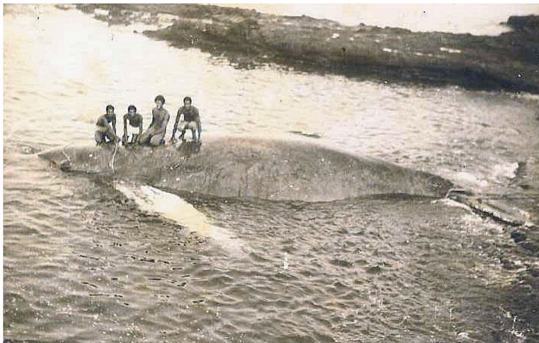
Fig. 2. Humpback whale Megaptera novaeangliae , Sinagoga inlet, near Tarrafal, São Nicolau, March–May 1977 (Pedro António dos Santos).

Tarrafal’s present tuna factory was constructed at the site of the old whaling station, even partly using the same premises. Unfortunately, the archives pertaining to the former whaling station have been lost or destroyed (Joaquim Pinheiro pers. comm.). So, by the 1920s, some two centuries of whaling in Cape Verde seas had come to a conclusion. But had it?