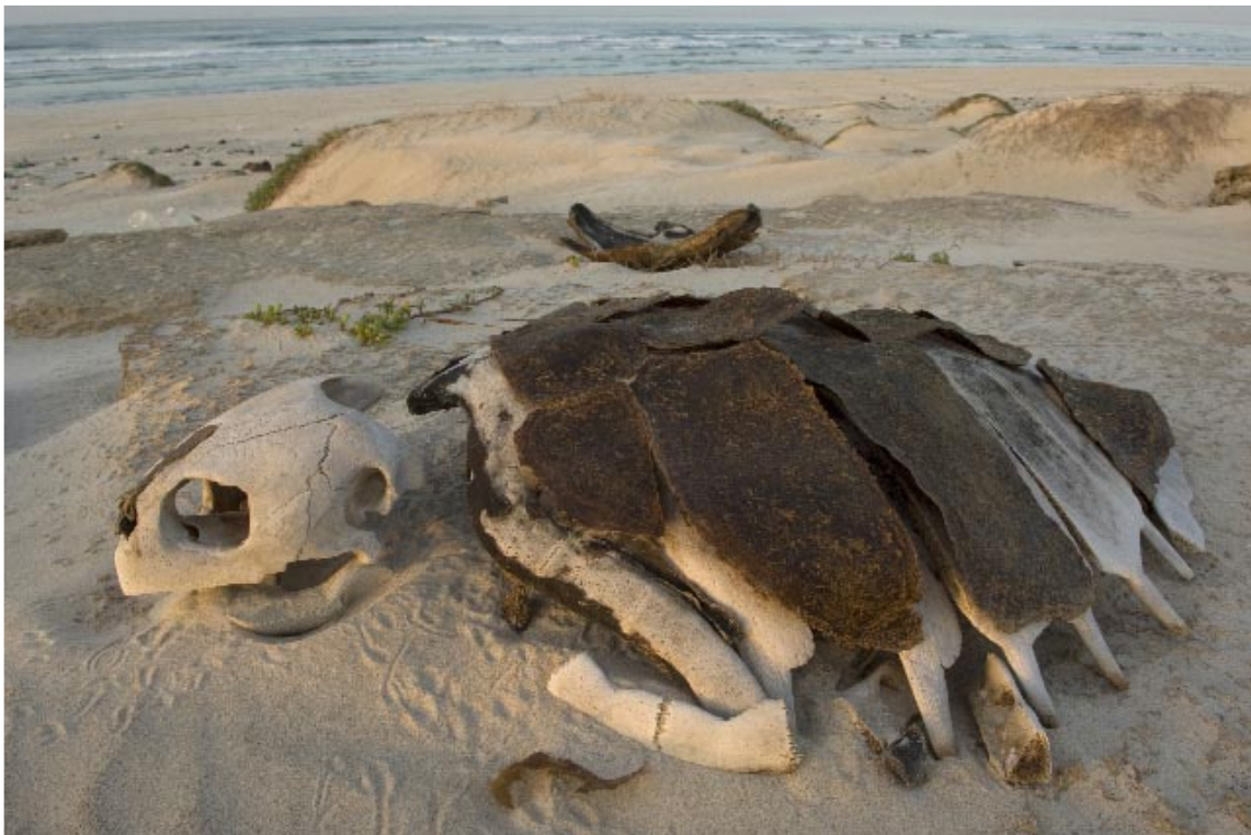
Fig. 4. Carcass of a slaughtered loggerhead turtle Caretta caretta , Praia da Boa Esperança, Boavista, 15 September 2009. The slaughter of turtles for meat consumption and the destruction of nesting habitats due to the development of the tourism industry are the main human caused threats to sea turtles in the Cape Verde Islands.

Atlantic and Mediterranean populations. Although the northward dispersal of Capeverdean juveniles is clear, Monzón Argüello et al. (2010a) concluded that ca. 43% of Capeverdean juveniles are not found in the studied feeding areas. These juveniles could be feeding at unknown and/or non-studied foraging grounds, but could also represent juveniles eliminated from the metapopulation (e.g. mortality in the early stages or in fisheries). Recently, a juvenile specimen found in an area near the coast of Ceará, Brazil, carried a haplotype that to date has only been identified in Cape Verde (Cardinot Reis et al. 2009). This indicates the need for genetic studies at other feeding grounds in the western Atlantic and the possible existence of feeding grounds of juvenile loggerheads yet to be discovered. It is possible that a significant number of juveniles disperse to American waters or southward to the Gulf of Guinea (Monzón Argüello et al. 2010a).