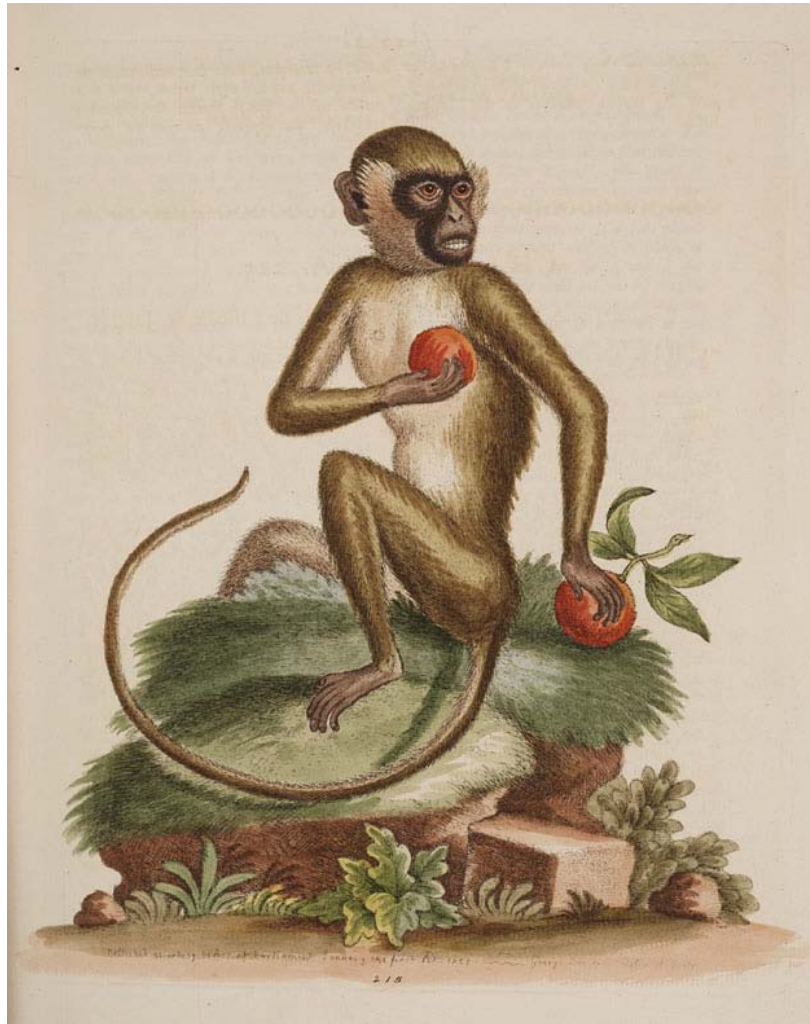
Fig. 2. The St. Jago Monkey, as depicted in Plate 215 of George Edwards' (1758) Gleanings of Natural History , on which Linnaeus (1766) based his Simeea sabaena .

and remarking that “it’s often called the green monkey”, but “our seamen generally call them St. Jago monkies, they being brought from St. Jago, one of the Cape de Verde Islands” (Edwards 1758: 10).