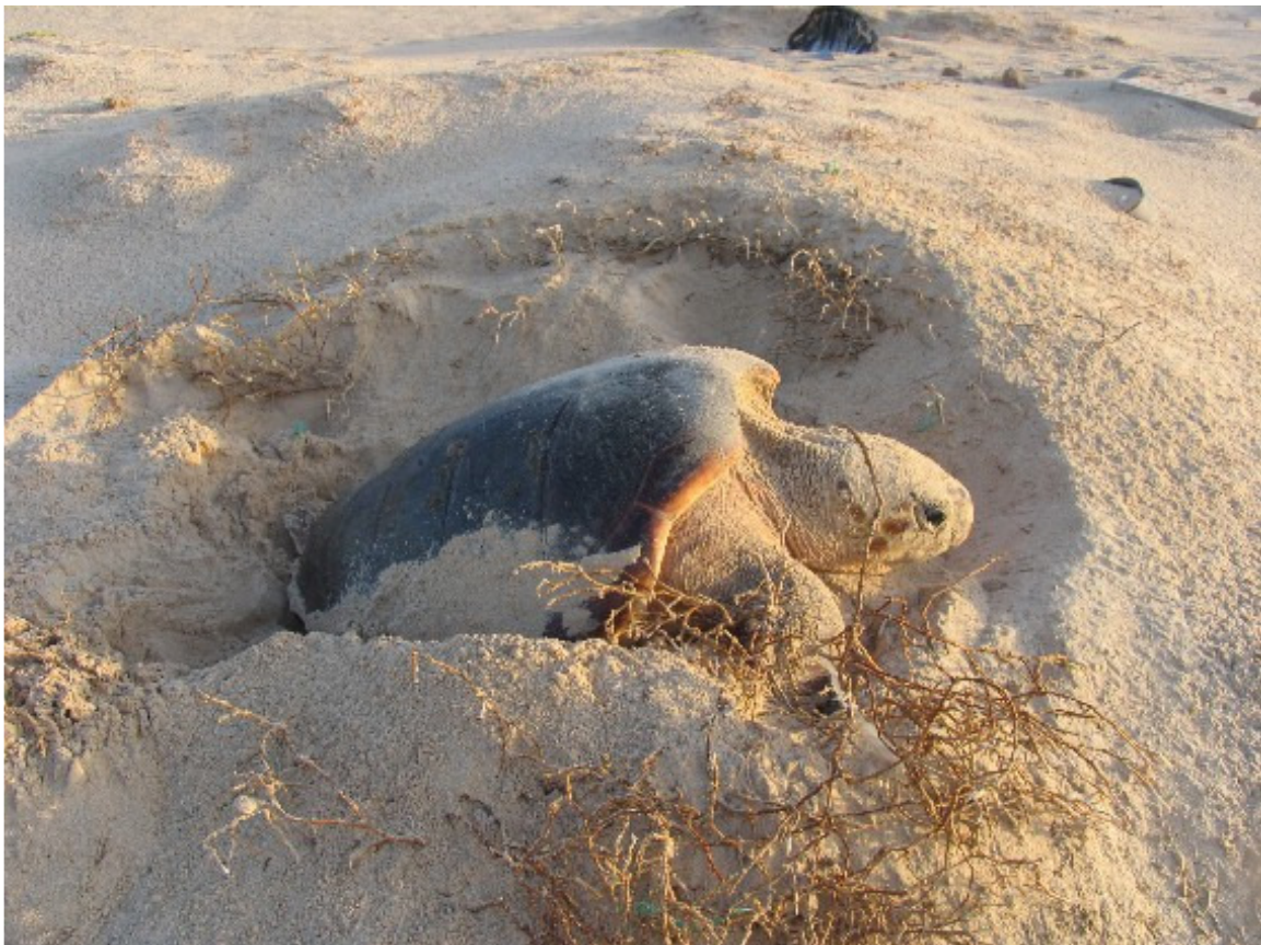
Fig. 1. Exceptional diurnal nesting of a loggerhead turtle Caretta caretta , Praia do Carreto, Boavista, 3 September 2007 (Adolfo Marco).

Through the analysis of molecular microsatellite markers, it has been possible to evaluate the levels of multiple paternity in this loggerhead population. In research conducted by Sanz et al. (2008a, b), 66.7% of the analyzed nests had been fertilized by more than one male. The average number of males found per nest was 2.2, although within one nest, a single male often fertilized more than half of the eggs. The high level of paternity, together with the fact that males of nests from different females were also different, suggests that the adult male population is abundant, despite being persecuted by poachers, as some of their body parts are believed to be aphrodisiac. Furthermore, the loggerhead nesting aggregation of Boavista has the highest rate of multiple paternity registered to date for this species.