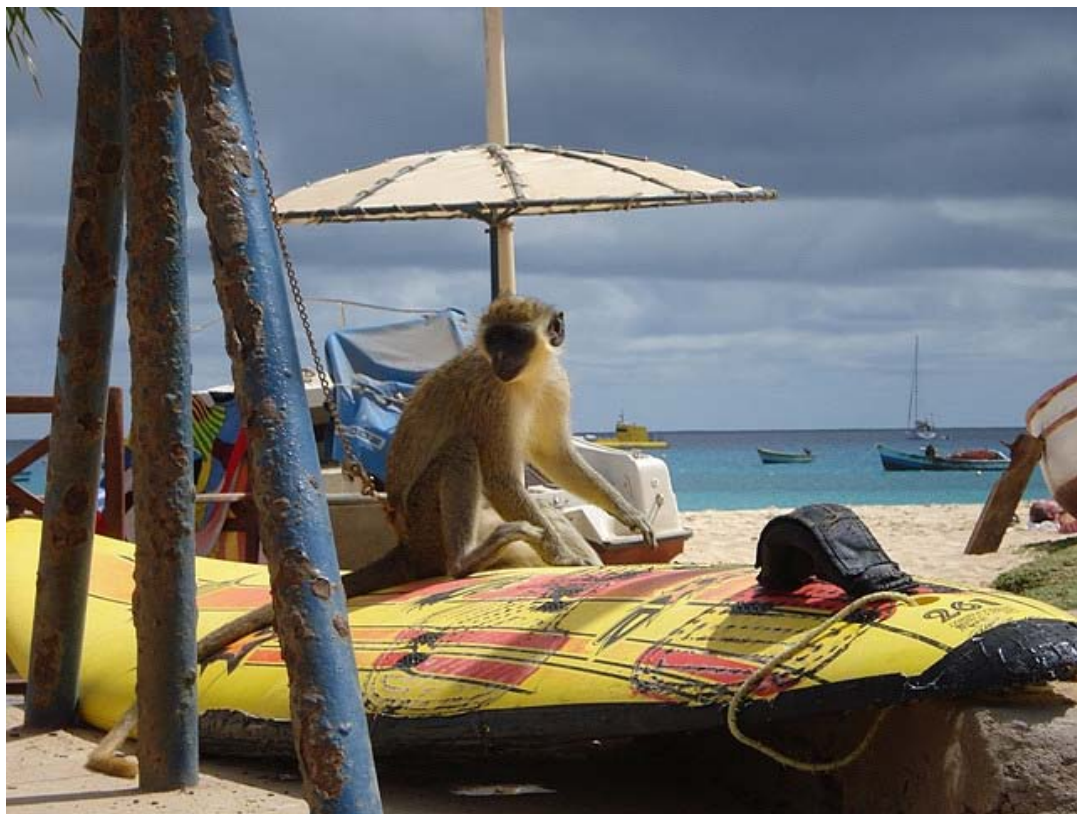
Fig. 5. Green monkey Chlorocebus sabaesus kept as a pet, Santa Maria, Sal, 24 March 2008.