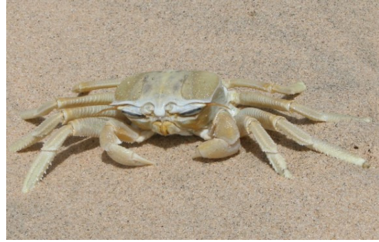
Fig. 3. Predation by ghost crabs Ocypode cursor , the inundation of nests by high tides and the presence of clay in the incubation substrate are the main natural causes of mortality in sea turtle nests in the Cape Verde Islands (Adolfo Marco).

Incubation temperature varies depending on the year, the time of incubation within the same nesting season and the nesting site, but on the main nesting beaches the annual average temperature of sand at 40 cm depth ranges from 26.5°C to 30.6°C (Abella et al. 2007, 2008b). On beaches with black sand, incubation temperature can be considerably higher, causing problems to developing embryos. From the average incubation temperature during the period of sex determination (i.e. the second third of incubation), it is estimated that the sex ratio produced at the main nesting beaches is biased towards females, representing ca. 65-75% of hatchlings (Abella et al. 2007). Delgado et al. (2008) obtained very similar results in their histological analysis of dead hatchlings found on the beach. Compared with other Atlantic populations, where it is estimated that the ratio of female hatchlings is around 90% (Marcovaldi et al. 1997, Hanson et al. 1998, Baptistotte et al. 1999), these data indicate that despite the high production of females a considerable number of males is produced.